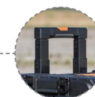
TELESCOPIC CARRYING HANDLE