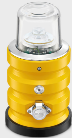
6X PORTABLE HELIPAD LIGHTS