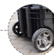
WHEELS FOR EASY TRANSPORTATION