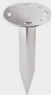
6X MOUNTING STAKES FOR GRASS