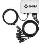
OCT-102 CHARGING STATION