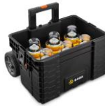
PROTECTIVE CASING FOR SP-102 LIGHTS