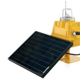
SOLAR TAXIWAY LIGHT