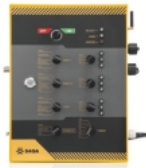
UR-201 CONTROL & MONITORING UNIT