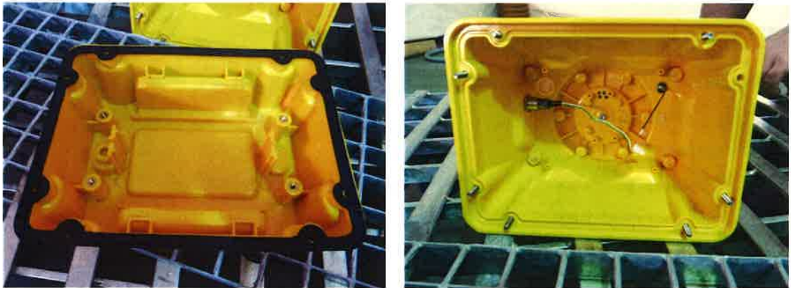
Fig. 4. Test sample 5576 - Visual internal inspection after the IPx7 test.