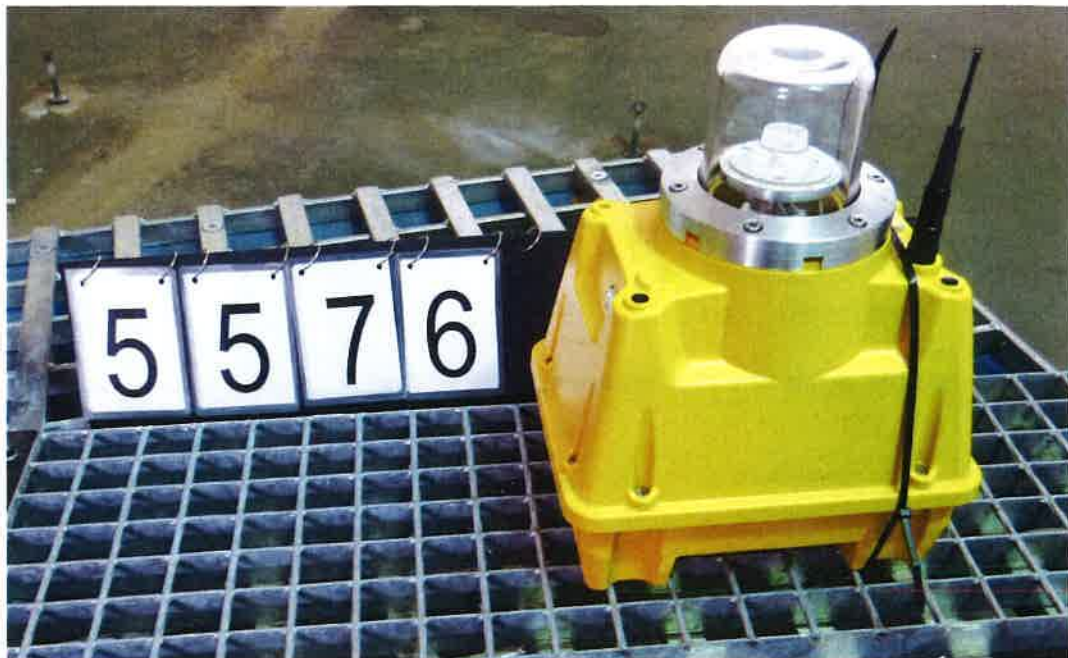
Fig. 1. Test sample 5576 – before the IPx7 test.