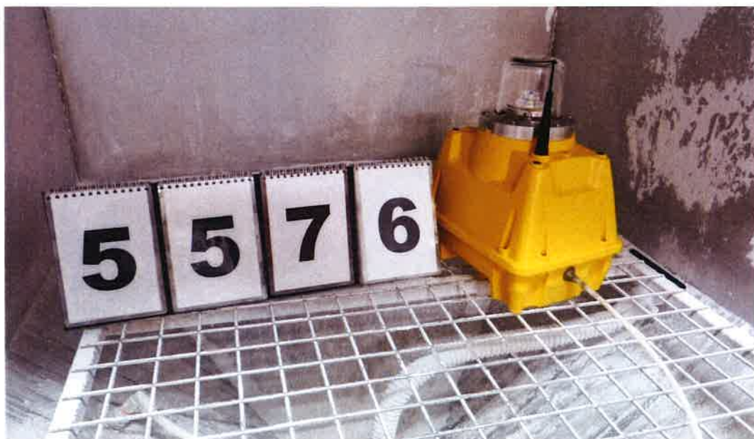
Fig. 2. Test sample 5576 in the dust chamber – before the IP6x test.