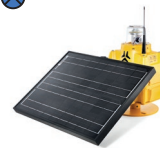
SOLAR TURNING PAD LIGHT