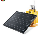
SOLAR RUNWAY THRESHOLD END LIGHT