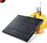
SOLAR RUNWAY END LIGHT