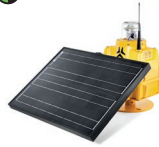
SOLAR RUNWAY THRESHOLD LIGHT