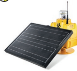
SOLAR RUNWAY EDGE LIGHT W/Y