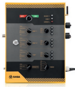
UR-201 CONTROL & MONITORING UNIT