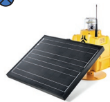
SOLAR TAXIWAY EDGE LIGHT