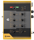
UR-201 CONTROL & MONITORING UNIT