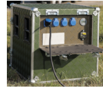
POWER BANK FOR PAPI