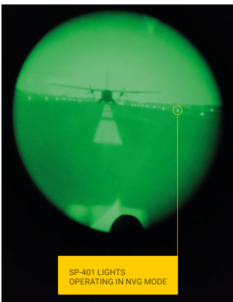
SP-401 LIGHTS OPERATING IN NVG MODE

S4GA Military Trailer is the best solution for military air bases, temporary runways and humanitarian missions.